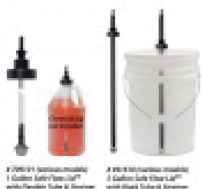
# 443790 Metering Tip Driver # 336340 Water Pressure/Flow Test Kit # 709101 Jug Lid with Suction Tube