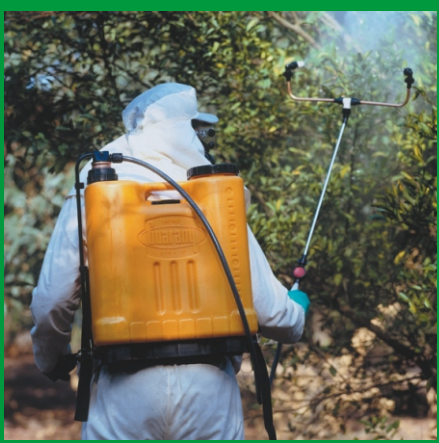
sal boom - code 9798 - optional