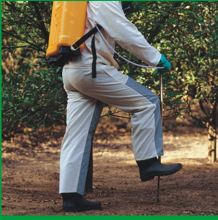
oil injector - code 4575 - optional accessory