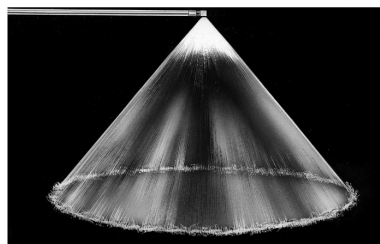
Hollow Cone 80°

Spray pattern: Hollow Cone Spray angles: 70° to 120° Flow rates: 0.125 to 145 l/min