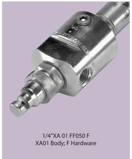
1/4"XA 01 FF050 F XA01 Body; F Hardware