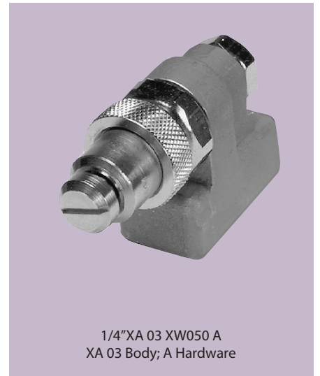
1/4"XA 03 XW050 A XA 03 Body; A Hardware