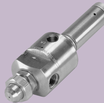
1/4" XA 02 PR050 E XA 02 Body; E Hardware

Dimensions are approximate. Check with BETE for critical dimension applications.